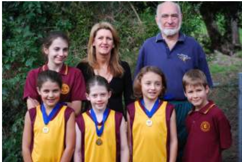
Queensland Athletics All Schools Cross Country Championships Queensland Champion under 9 girls team –Ithaca Creek.