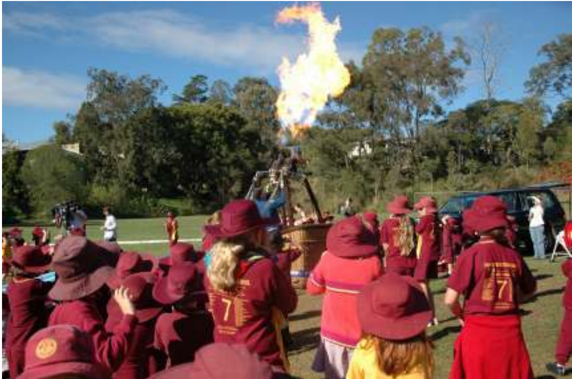
RAAF Hot Air Balloon visited the school in 2008