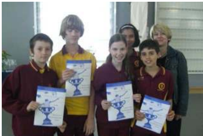
Ithaca Creek's Queensland Readers Cup Team 2008

The school uses a program management structure of management under the two areas of Early years Education and The Middle Phase of Learning education.